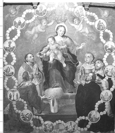
Our Lady of the Rosary

May the Lord bless us all the days of our life.